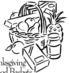
Thanksgiving Food Baskets

We are working with DB Middle School nurse to identify families who will receive food baskets from our congregation for Thanksgiving. The sign-up sheet is on the table in the narthex. Cash donations will be used to purchase smoked turkeys (some families do not have an oven to cook large turkeys).